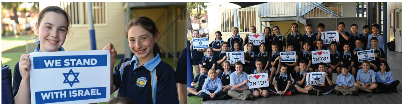
Photo: Masada College students in Sydney Australia send a warm and loving hug to their school twinning program in Aliza Begin school, Migdal Ha'Emek.

During the current crisis, our partnership cities and regions have reached out to offer their unwavering support and express their grief and concern. Some communities are partnered with cities in the south that are under fire, and others with mixed cities experiencing Jewish-Arab violence. In northern Israel, a number of our partnerships include activities for non-Jewish youth, who have appreciated the Jewish community's expressions of care and support for them. It is heartening to see, amidst the current conflict, Jews and Arabs standing together against violence and choosing to live together in tolerance and coexistence.