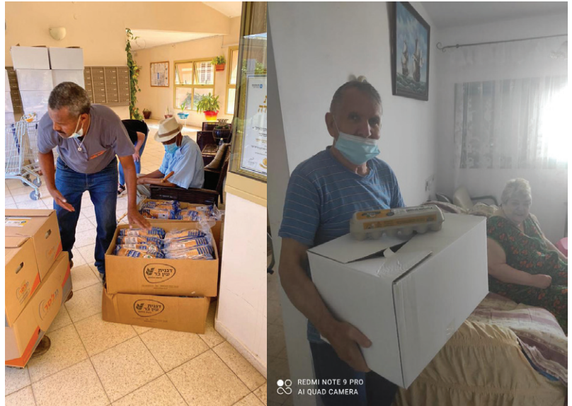
Photo: Amigour food package distribution

Over 3,000 seniors living in Amigour housing facilities—including many Holocaust survivors—are currently under fire. Elderly residents spend many hours in shelters, and Amigour does everything it can to help them. We have increased staff hours and have distributed food packages including dairy products, fruits and vegetables, eggs, and preserves. In addition, social workers are providing emotional assistance. Before the Shavuot holiday, we will distribute thousands of challahs and cheesecakes to lift residents' spirits.