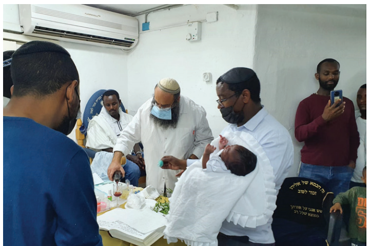
Photo: Brit Milah of olim from Zur Israel that was performed in a shelter due to the constant sirens

We are reinforcing our teams of absorption center staff and social workers to take care