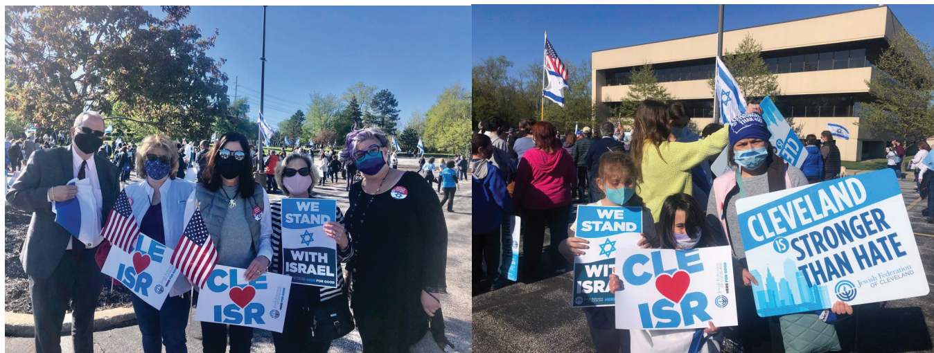
Photo: Rally of Support for Israel in Cleveland

Jews around the world are watching the situation with concern, particularly those who are considering Aliyah. In many countries, anti-Israel protests have erupted, and anti-Semitic rhetoric has flared. The Jewish Agency's staff works tirelessly to share updates on the crisis with community members, leaders, and members of the media; counter misinformation; and provide support and solidarity.