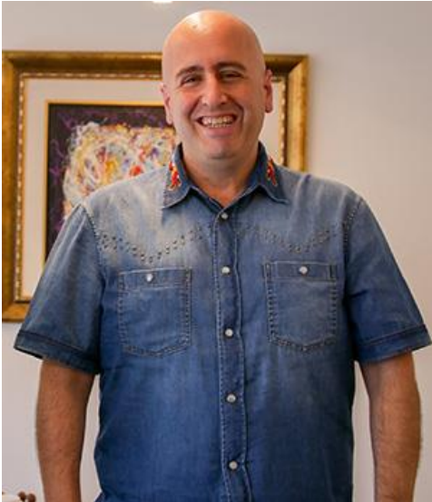
The Jewish Federation of Greater Washington supports Incorporate Israel through a $40,000 allocation.